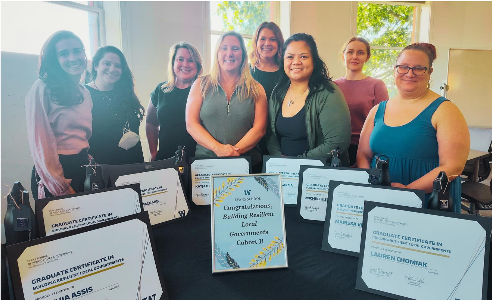
Inaugural cohort of the Building Resilient Local Governments Graduate Certificate